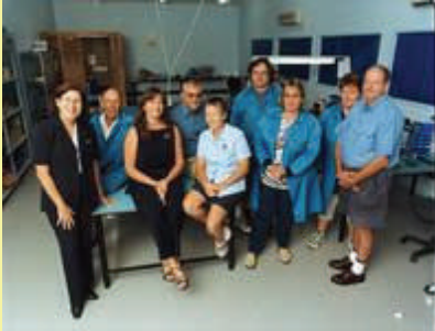
The Microair Team