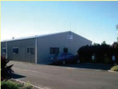
The Microair Factory in Bundaberg, Queensland, Australia